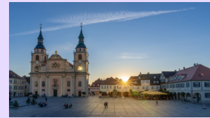
Market Place, © Martina Denker