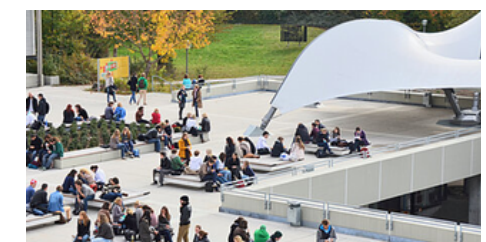
LUE, © PH Ludwigsburg