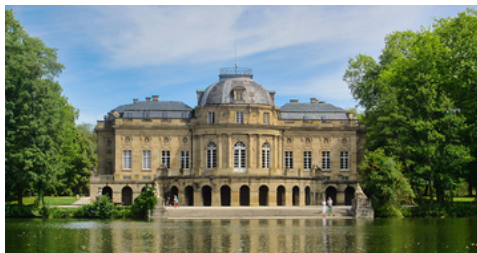
Schloss Monrepos

Enjoy your free day and take a walk to Monrepos Palace or meet your buddies or other international students.